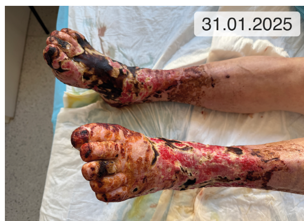
Figure 5. Frostbite of the lower limbs – wounds on day 26 of hospitalisation after cleansing with antiseptic preparations

General Surgery Ward, due to third-degree frostbite of both shins and feet. The patient reported walking in the snow for several hours in low temperatures without shoes. Upon admission, she was alert, oriented to self, and allopsychic, exhibiting inappropriate affect and a depressed mood. A local examination revealed cold limbs with damaged skin on the feet and the lower parts of both shins. The tissue damage covered approximately 18% of the total body surface area. The pulse was weak, and sensation was impaired with signs of hyperalgesia. The tissue damage was initially classified as second- to third-degree frostbite (Fig. 2). There was a full-thickness skin wound on the right foot suggesting ulceration. Initial treatment was administered, and tissue biopsies were taken for microbiological evaluation. Laboratory tests showed signs of inflammation: C-reactive protein (CRP): 9.01 (0–5 mg/l), procalcitonin (PCT): 840 (150–400; 10 3 /