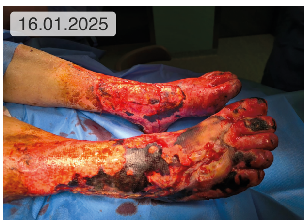
Figure 4. Necrectomy in the operating room on day 11 of hospitalisation