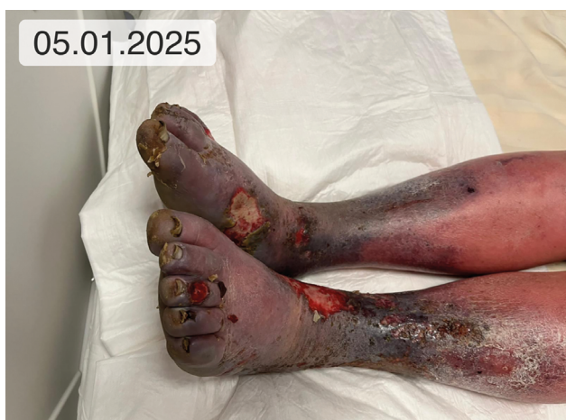
Figure 2. Frostbite of the feet and lower legs on admission to hospital, tissue swelling and undermining, incomplete and full-thickness skin wounds, hyperalgesia, local treatment with PVP-I-soaked Hydrofiber dressing plus emollient