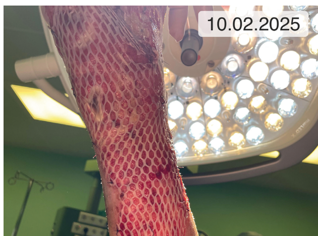
Figure 6. Free split-thickness skin graft with 1 : 3 mesh placed on the left lower leg