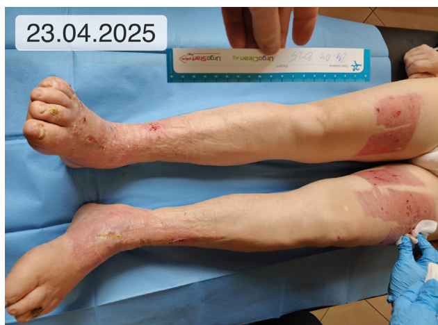
Figure 8. Healed wounds after frostbite of the lower limbs during an outpatient follow-up 5 weeks after the end of hospital treatment

damage and the risk of sepsis. However, the patient did not consent to this procedure. The consulting psychiatrist found her to be fully conscious and capable of making decisions. Over the next few days,