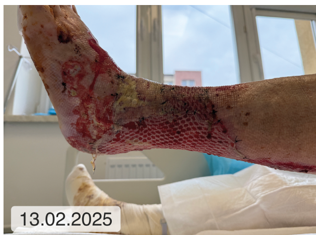
Figure 7. Skin graft on the left lower leg on postoperative day