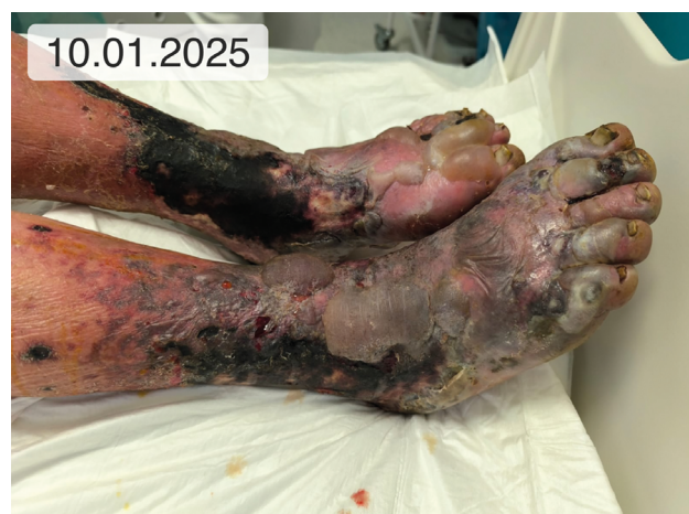
Figure 3. Conversion of frostbite changes on the 5th day of hospitalisation within the skin and subcutaneous tissue, and blisters associated with separation of the epidermis